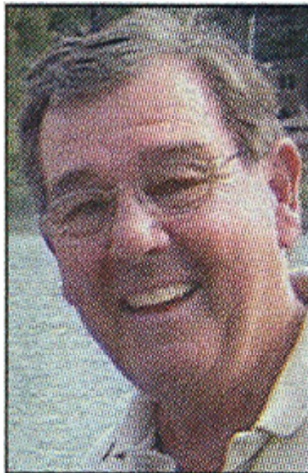
Mayor Albert Ellis

Lake area including the new dam and spillway, the development of the Village Green and the development of the Athletic Complex Center for Recreation and Community Events.