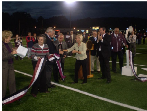
The Krausche Field ribbon-cutting ceremony of the new turf field

"This win is tremendous," Lake added. "Hillside is a very good football team. This is a very, very good win for our kids."